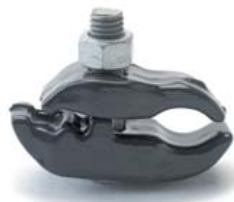
Parallel Beam Clamp PARALLEL CONDUIT CLAMP