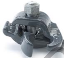
Edge Beam Clamp EDGE STYLE CONDUIT CLAMP