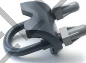
Right Angle Beam Clamp RIGHT ANGLE CONDUIT CLAMP