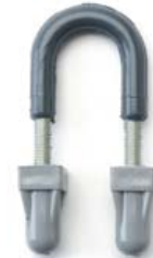
U-Bolt CONDUIT U-BOLT